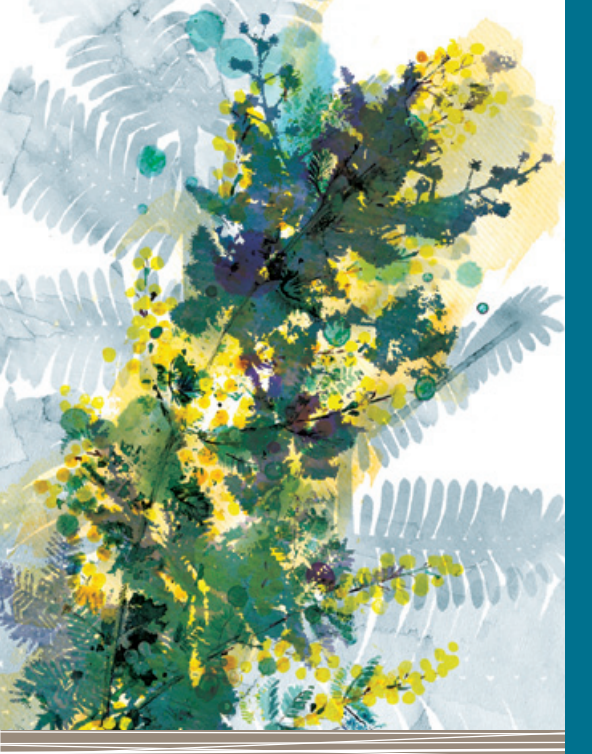
Relaxing Riverside Ramble Warrandyte Riverside Walk